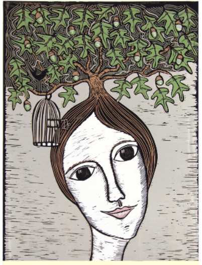
The artist writes: 'It takes a lot of courage to show yourself, to open your own cage, and let your soul be free!' – how is this a hopeful image?

Often in difficult times, we may only be able to see the challenges and they may seem so big that we may not always see the small signs of hope. This passage encourages us to look upward with hope. How might we spot the small signs of hope in the dark and difficult times?