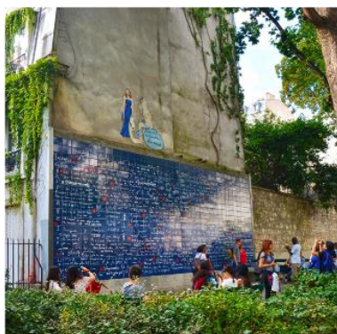
On this wall in Montmartre, 'I love you' is written in 250 different languages. Ask yourself: How would you illustrate a commitment to love others?

The scribe is reassured that Jesus gives the 'right' answer and echoes the importance of loving God and loving others. He recognises that these are the most important aspects of his faith. How might you complete the sentence, 'Love is...?'