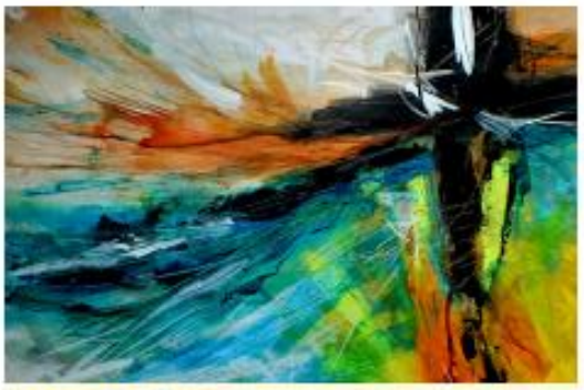
Ask yourself: What do you see in this picture? When have you experienced the power of the Holy Spirit?

The writer of Acts paints a vivid picture of this outpouring of God's Spirit, with echoes of the Sinai story where God is seen and heard as wind and fire. There is a clear indication of both diversity and unity as the Spirit rests on 'each of them' who are there to celebrate the feast of Pentecost together, and those from many nations hear the message in their own language. Peter's reference to Joel's prophecy also reminds his hearers that the Spirit is for all people.