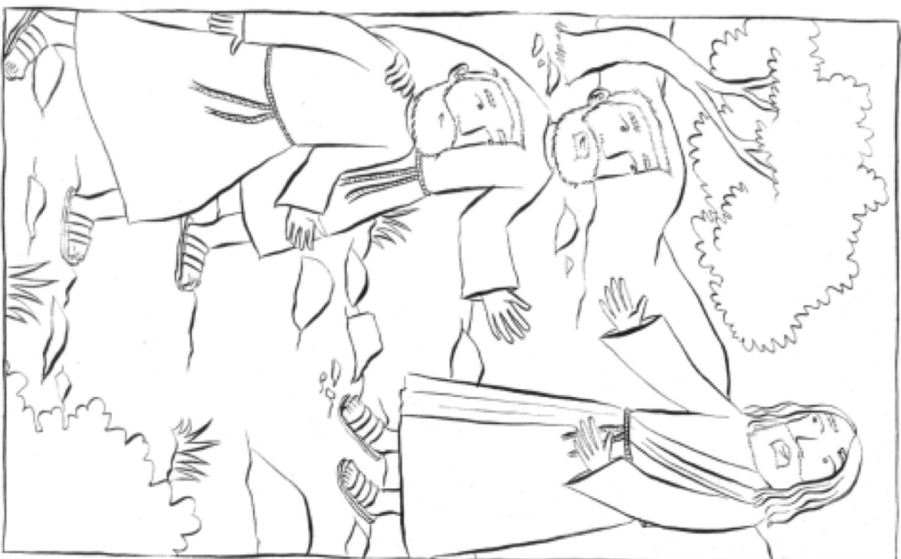
Philip brought Nathanael to, 'Come and see.'

Philip and Nathanael both have an unexpected encounter with Jesus.