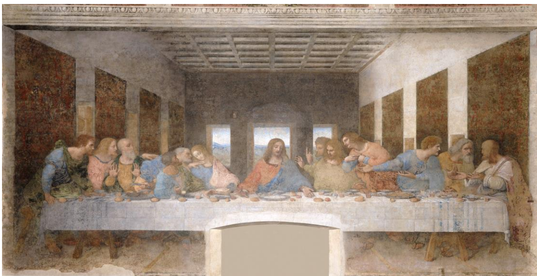
The Last Supper (1498), Convent of Sta. Maria delle Grazie, Milan, Italy